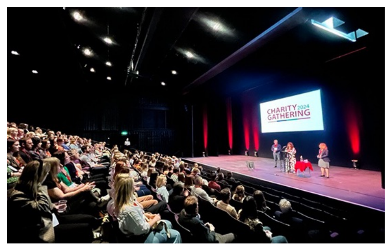
2024 Gathering in Newcastle

In addition, we look for organisations which are innovative and courageous in their approach. We are open to working with organisations which disrupt and challenge the status quo, taking risks, trying new approaches and speaking out about change needed to enable a better world. As funds are raised by players of People's Postcode Lottery, most of our charity partners will have strong public support. However, to fulfill our mission, we also support a range of causes that address gaps and priorities not covered in the existing portfolio.