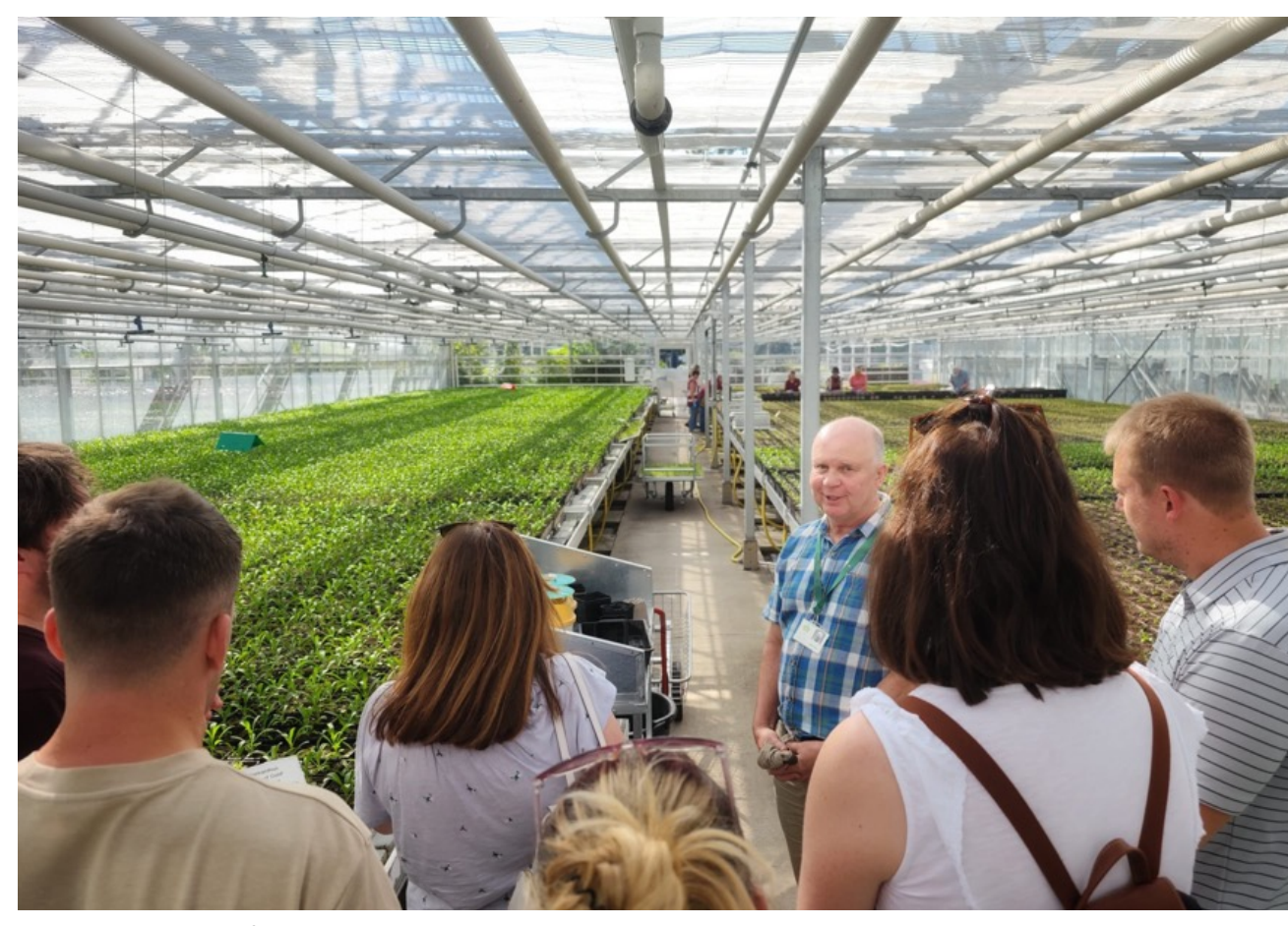
Postcode Lottery staff visiting Hyde Park nurseries