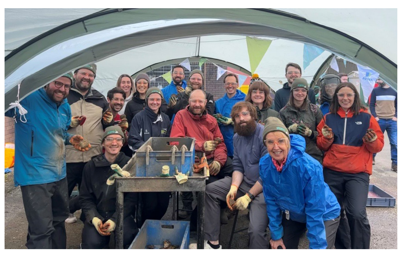
People's Postcode Lottery, volunteering on the 'restoration Forth' project with Marine Conservation Society and WWF