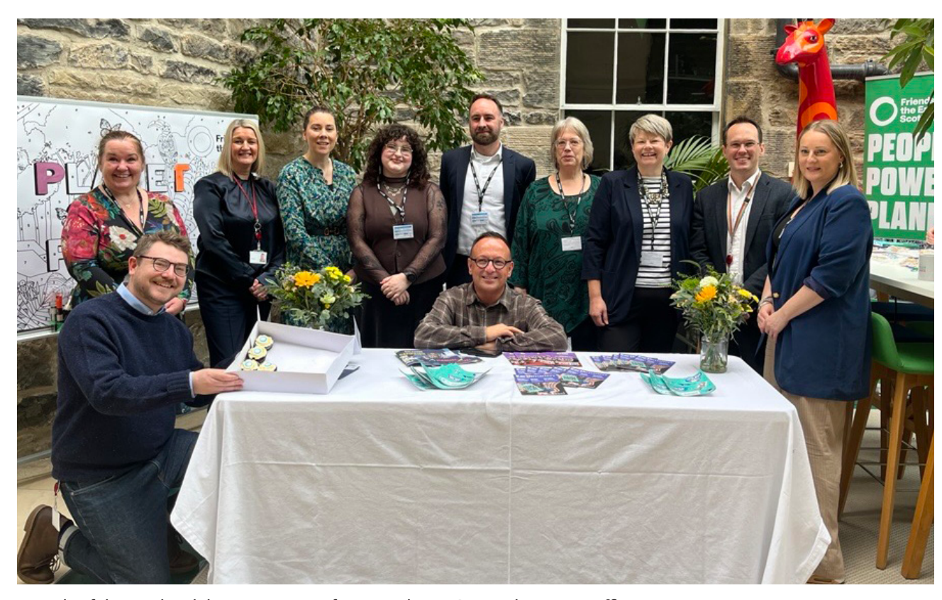
Friends of the Earth celebrate 10 years of partnership at Postcode Lottery offices

We manage delicate situations which may occur during the partnership carefully, recognising that, just as in the business world, government, and everywhere people work, issues may arise with charity organisations, particularly those operating in challenging contexts involving complex political dynamics or vulnerable populations. Procedures to prevent and address problems effectively, taking the needs of all stakeholders into account, should